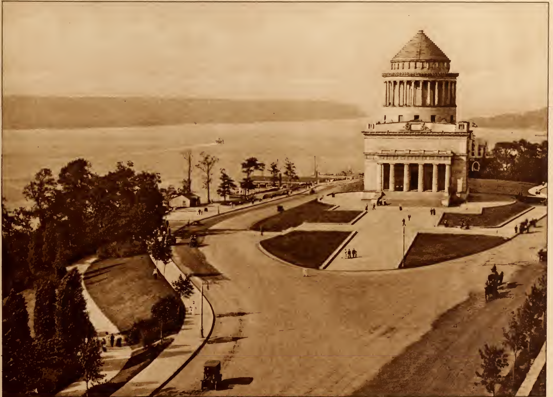
GRANT'S TOMB, commanding a magnificent view of the Hudson River and Palisades on Riverside Drive and 123d Street. This memorial, erected to the famous General by the City of New York in 1897, is 72 feet in height. It is built of white granite with marble interior and cost $600,000. General Grant and his wife are buried here.